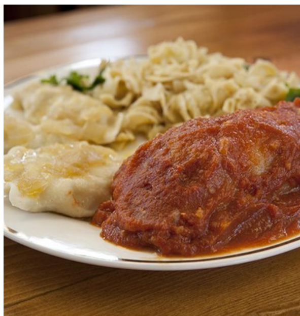
Plate price: $9.00

Dinner consists of 1 Halupki, 2 Pierogies, a serving of Halushki, and 2 cookies.